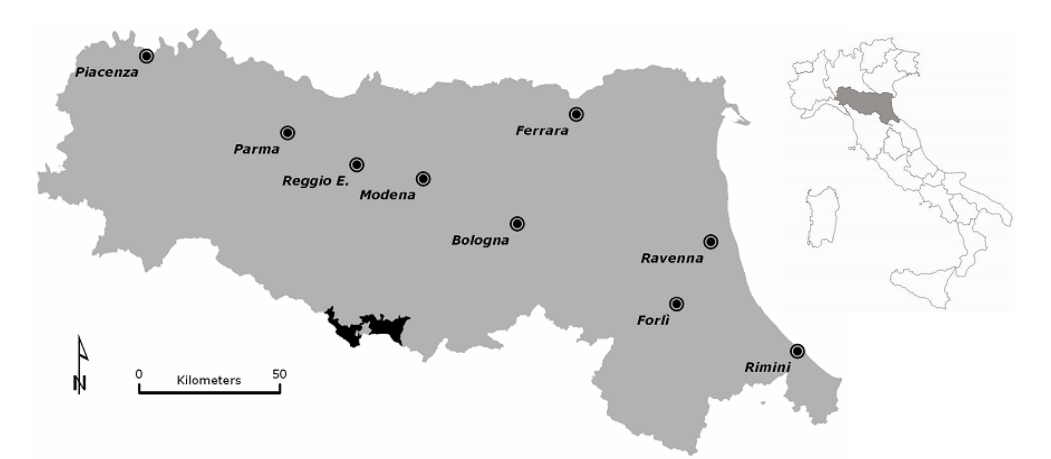
Figure 1 - Location of the study area (in black) in the Emilia-Romagna region (northern Italy).

By means of multivariate statistical methods (cluster and discriminant analysis), a representative sample (18 cells of 1 km<sup>2</sup>) was randomly extracted (Rossi, 1993). Analyses were performed using WinSTAT® for Excel and XLStat © 6.0.